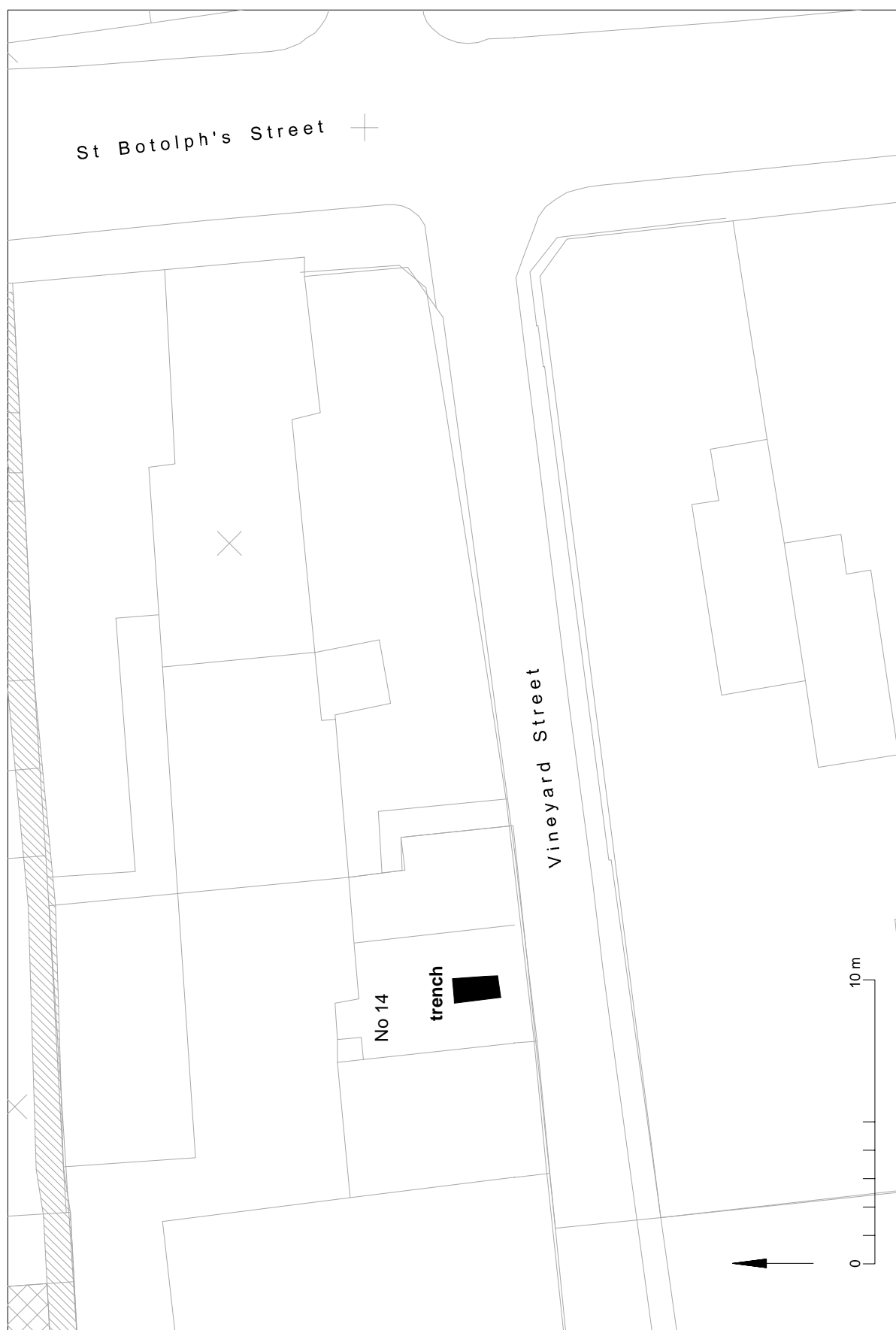
Fig 1 Trench location plan.